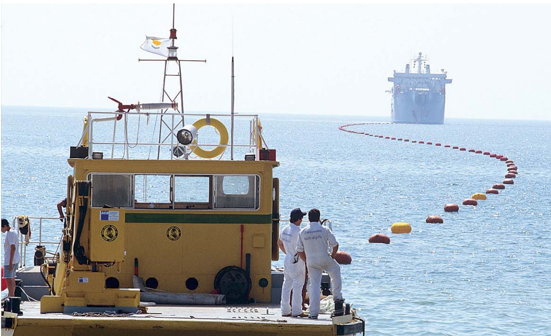
Landing of Alexandros subsystem at Pentaskhinos, Cyprus